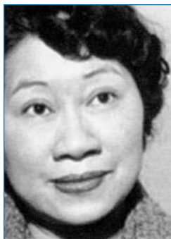
Rose Hum Lee

American history. And knowing that a lot of work still remains to be done to collect and preserve collections in the Asian Pacific American community, I hope students like me will also have the opportunity to contribute to and expand the understanding of our history."