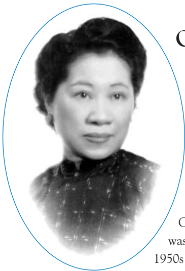
Rose Hum Lee